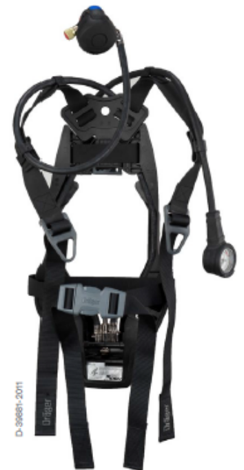
Dräger PAS Lite

With no electronics, durable space frame and harness and the time you save maintaining your PAS Lite, the cost of keeping the apparatus functioning throughout its lifetime is minimal.